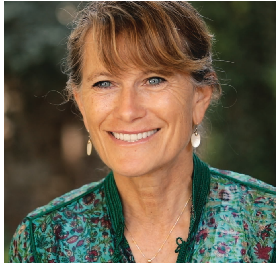
JACQUELINE NOVOGRATZ Chief Executive Officer, Acumen Fund

For more information, visit www.acumen.org