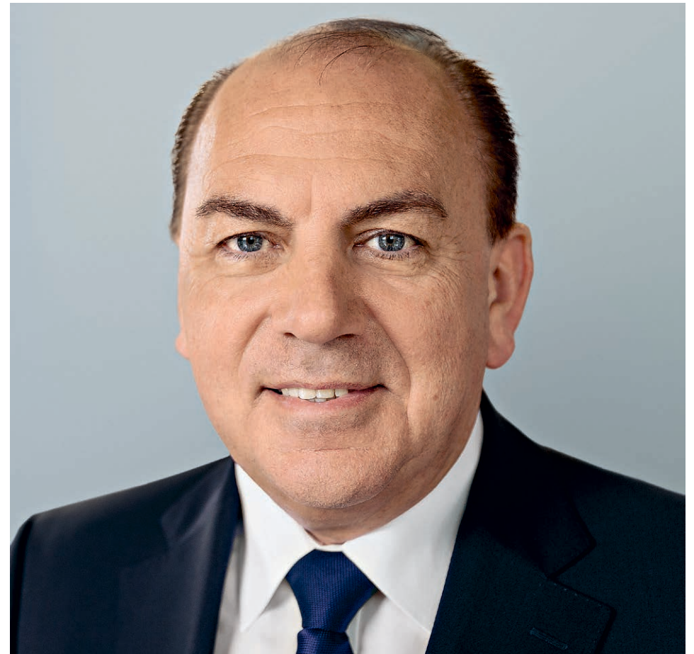
AXEL WEBER Chairman of the Board of Directors, UBS